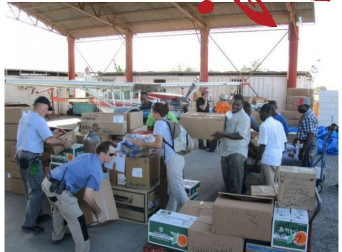
Our hangar is being used to help process and store the relief supplies that are constantly coming in

On Thursday , the decision was made to evacuate the MAF wives and children, due to increasing riots and violence. However, the plane coming to get them was not allowed to land. We contacted headquarters and were assured us that although things are changing, we are probably still going to Haiti: however, the timetable will most likely be changing.