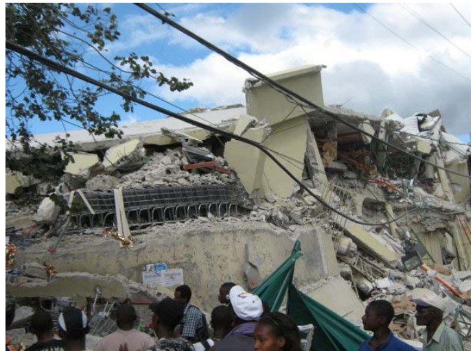
A grocery store near where our families live in Petionville