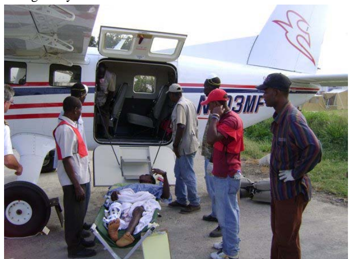
Loading an injured passenger into the Kodiak