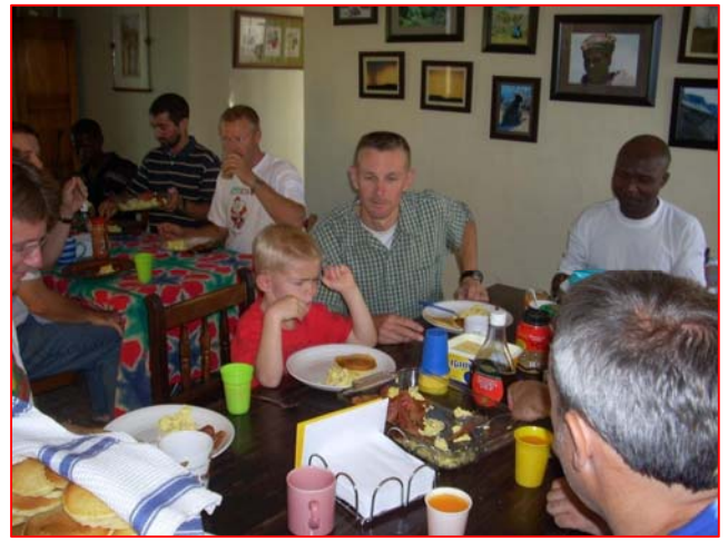
Birthday Men's Breakfast