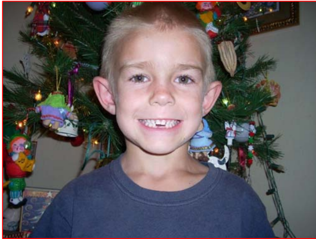
All I want for Christmas is my two front teeth!