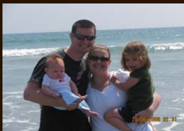
Our first family trip to the beach!