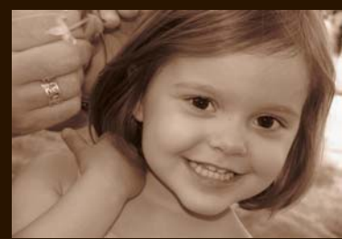
Getting a flower placed in her hair!