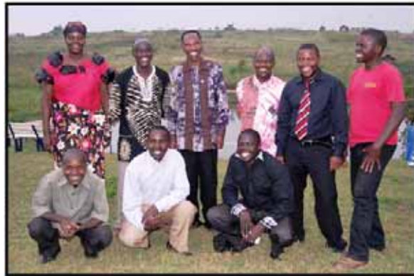
The reconciliation team